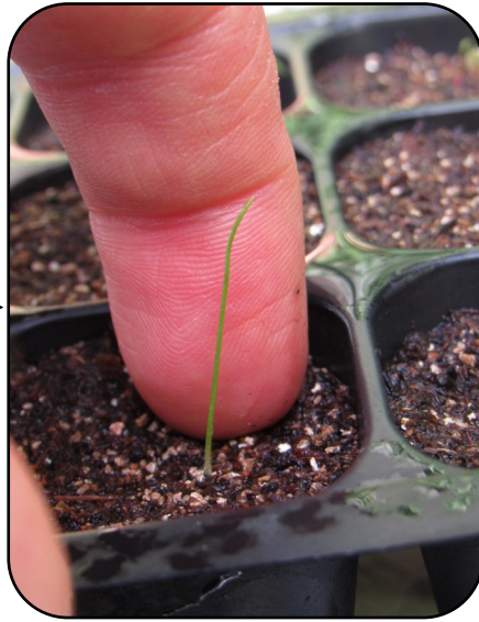
cotyledon (2 weeks old)