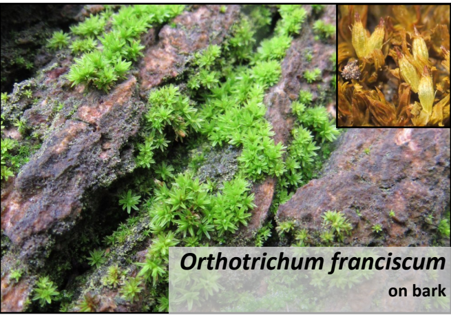
Orthotrichum franciscum on bark