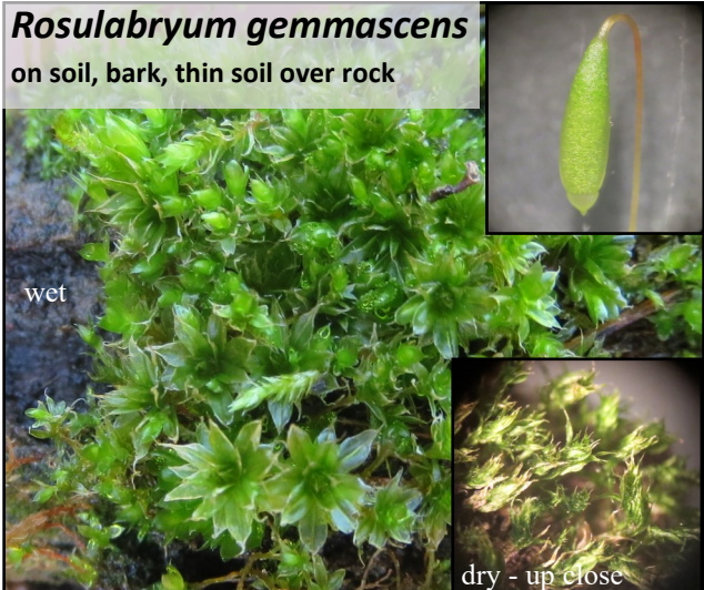
Rosulabryum gemmascens on soil, bark, thin soil over rock