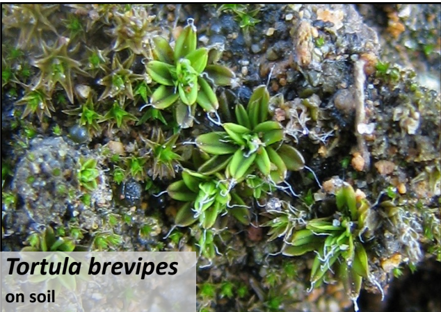
Tortula brevipes on soil