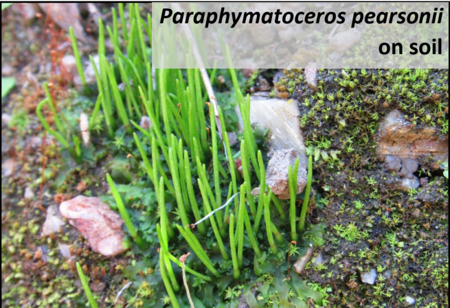
Paraphymatoceros pearsonii on soil