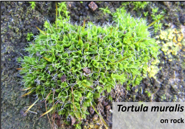
Tortula muralis on rock