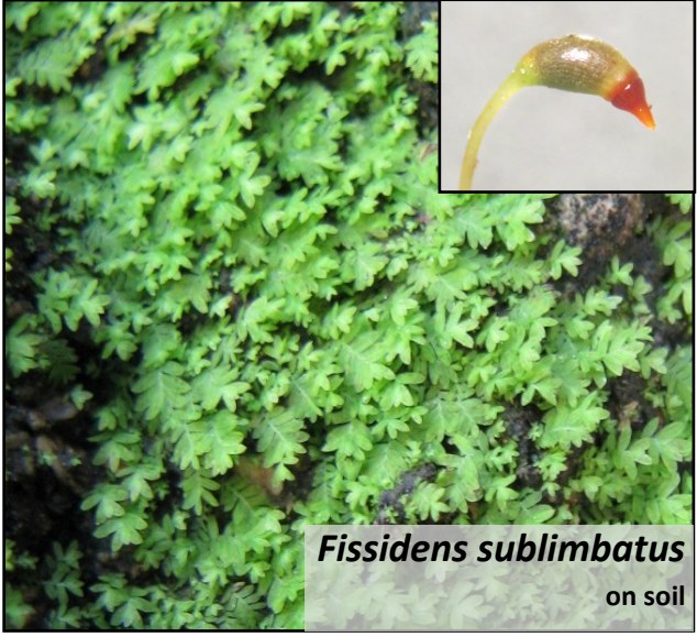
Fissidens sublimbatus on soil