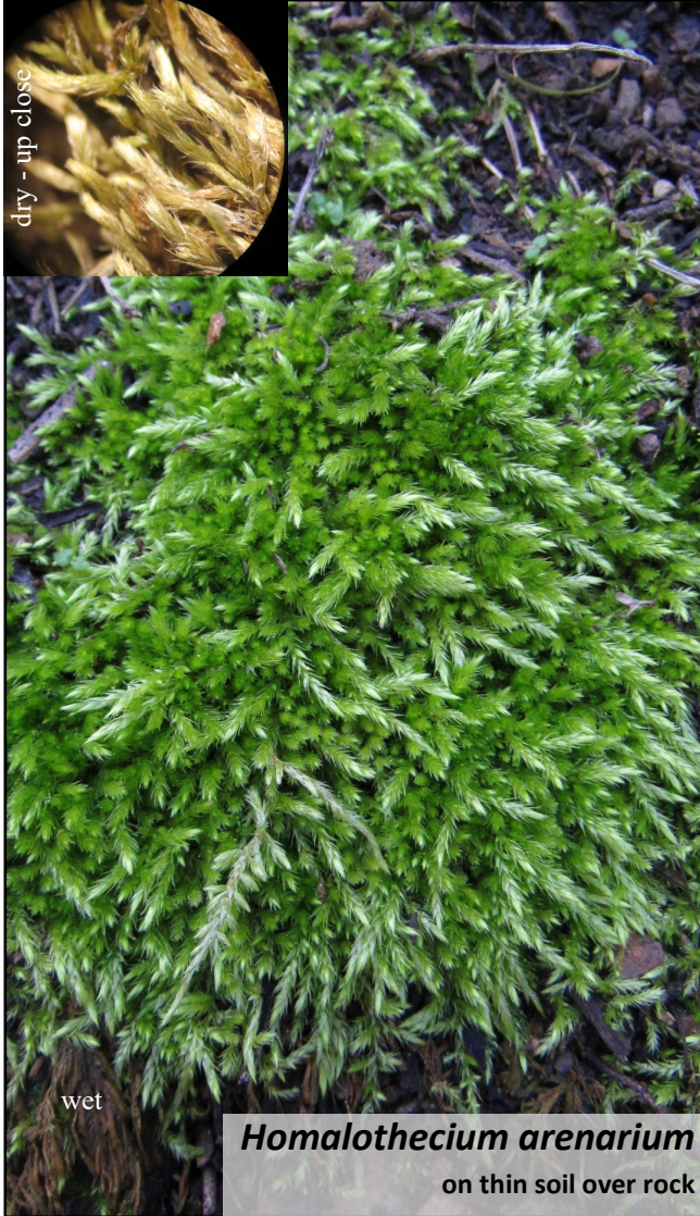
Homalothecium arenarium on thin soil over rock